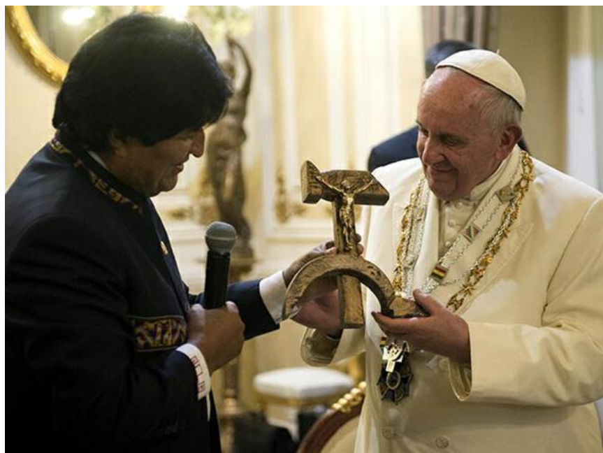
Francis receiving the Marxist crucifix from Bolivian President Evo Morales